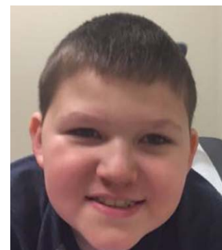
FIGURE 2 Frontal view of child in Family 2 showing the facial features characteristic of Angelman syndrome, including prominent cheekbones, thin vermilion of the upper lip, and prognathism [Color figure can be viewed at wileyonlinelibrary.com ]

The only reportable variant detected by clinical testing for a panel of genes associated with syndromic and non-syndromic autism in the child from Family 2 was the same UBE3A variant: c.2T > C (p.Met1Thr) [GenBank transcript: NM_130838.1]. Testing of both parents did not detect this variant, therefore, this variant was apparently de novo in this child. The possibility of germline mosaicism for this variant in either parent could not be excluded. No suitable polymorphic markers were identified in the genomic region around this variant to determine whether the variant was on the paternal or maternal allele. However,